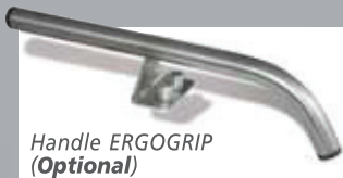
Handle ERGOGRIP (Optional)