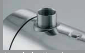
Motor body with suction port