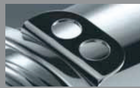
Cable fixing bridge